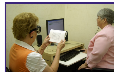
The Visagraph is part of baseline testing done prior to beginning the program.

“We don’t eliminate other therapies, because people may still need to go back to [them],” Moore said, “but what happens is that typically, after they’ve done the Individual Sensory Program, their other therapies take off like rockets.”